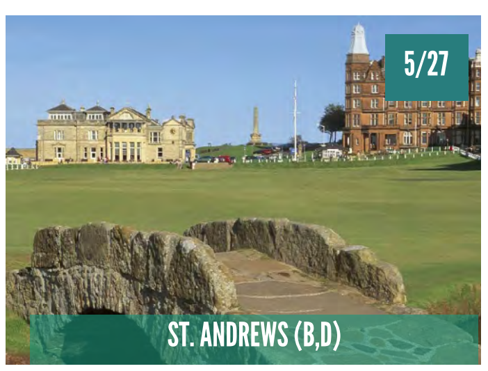
B - Breakfast