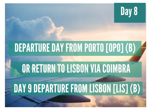
B - Breakfast