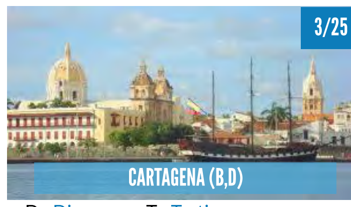
B - Breakfast L - Lunch